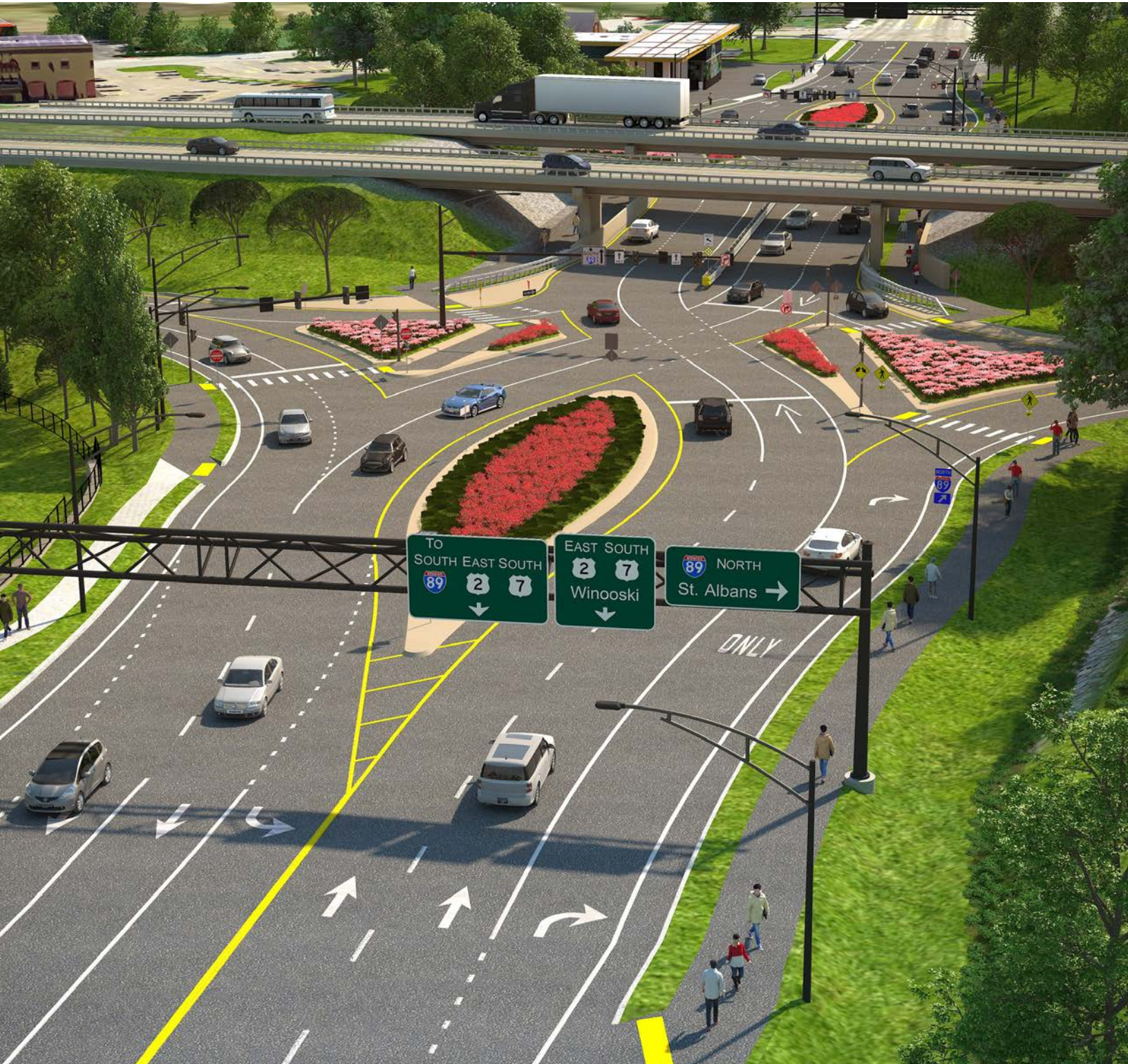
Diverging Diamond Intersection, Colchester, Vermont