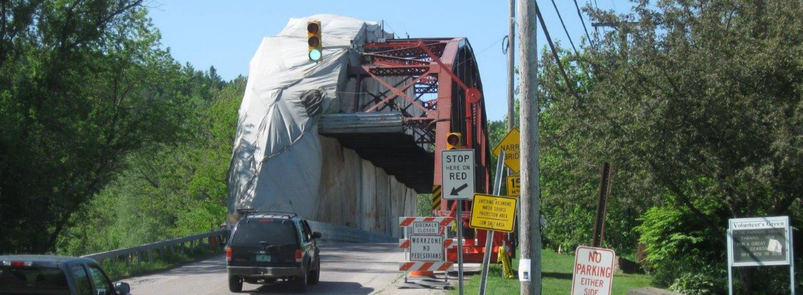
Richmond Bridge Painting, Richmond, Vermont