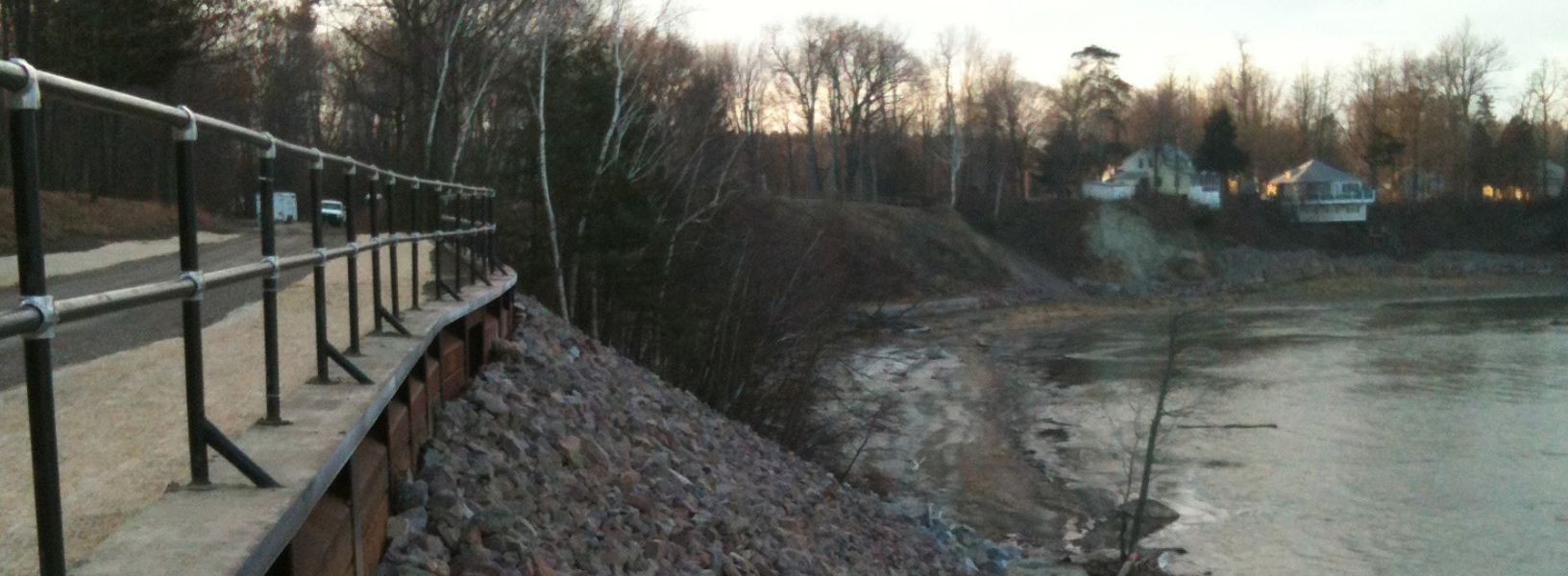
Burlington Bike Path Slope Repair, Burlington, Vermont

RELEVANT PROJECTS: Montpelier Shared Use Path, Burlington North Ave. Unsignalized Crosswalks, Williamstown Sidewalk & Pedestrian Bridges, Burlington Waterfront Access North Phases I & II, Burlington Champlain Elementary Pedestrian Improvements, South Hero Bike Ferry and Causeway Improvements, Burlington Church Street Electrical and Lighting Improvements, Burlington Gazo Ave. Outfall Repair, Hartford Railroad Bridge over Bridge Street.